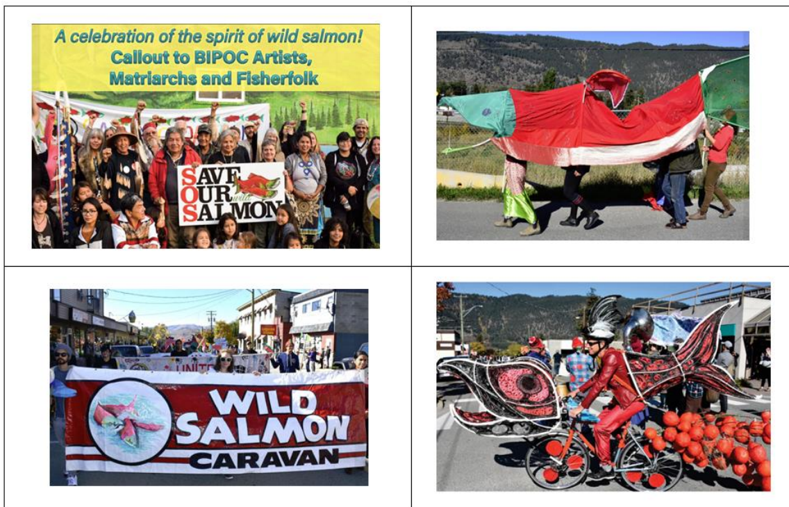
Inhabiting Salmon Art in the Wild Salmon Caravan