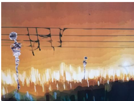
Installation by Rike Sitas and Dean Henning

How do we, adult educators, scholars, activists, play, engage, inhabit ‘climate justice’ – its theory and practice? What roles can we play to mitigate and adapt to the dramatic, anticipated environmental changes? It’s a vast, complex landscape which requires collective insights, imagination, and action. Solving the climate crisis affects all aspects of society. Therefore, our own education as adult educators, scholars and activists is essential.