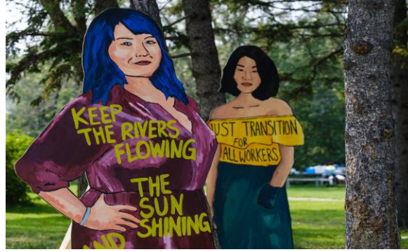
Figure One: Rivers and Transitions

Although there are dedicated people fighting for climate justice in Alberta, the project unfolded in a dominant political and cultural atmosphere of active resistance to climate action as Alberta remains committed to fossil fuel extraction in general and more specifically, to the TransMountain Pipeline expansion project which will pump oil/bitumen to the coast of British Columbia where it would be shipped worldwide on supertankers.