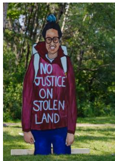
Figure two: Indigenous justice