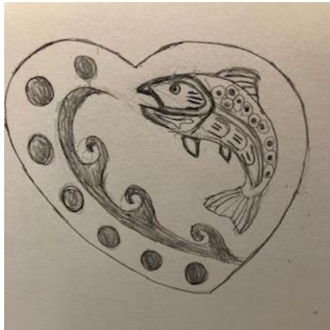
Figure 2. Indigenous Relationality: Water with Trout (Taylor, A.) used with permission