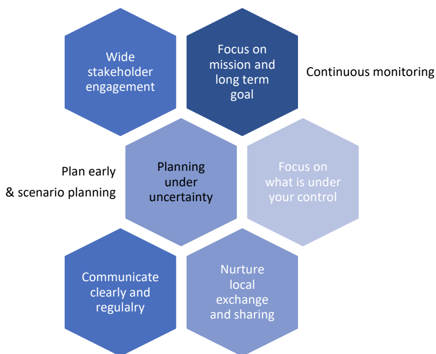
FIGURE 1 PRINCIPLES FOR PLANNING UNDER UNCERTAINTY