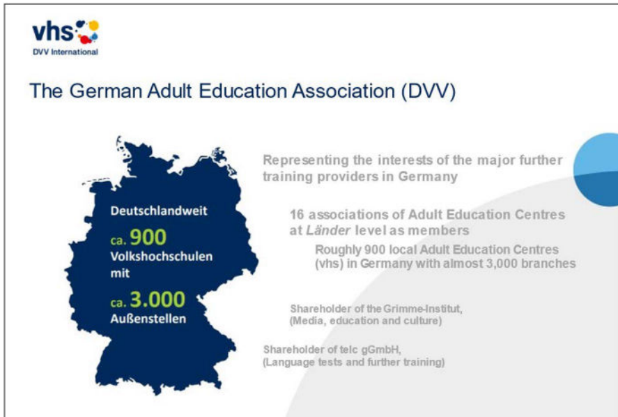
Figure 1 Infrastructure of the German adult education association, Deutscher Volkshochschul-Verband (DVV).